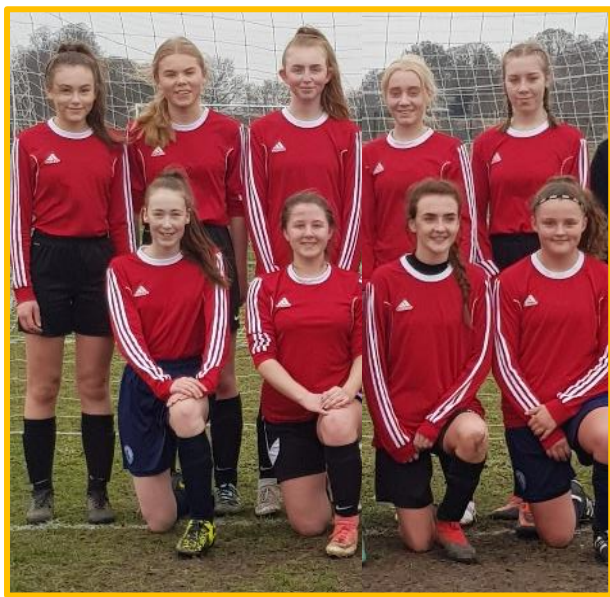
The U16 Girls' Football team:

On Wednesday 20 March, the U16 Girls' Football team travelled to Kesgrave High School to play in the semi-final of the U16 Girls' Suffolk County Cup. After an early goal from Kesgrave inside the first 10 minutes, Benjamin Britten dominated the game with an outstanding team performance and went on to win the game 3-1 . The team are now through to the County Cup Final which will take place at Needham Market FC on Thursday 9 May at 5pm. It was a fantastic performance by all involved and an outstanding achievement to reach the final for the second time in three years . We wish the girls all the best for the final.