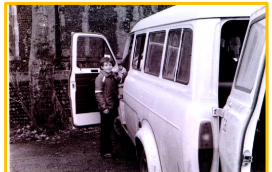
Above: Students climb aboard the School's first minibus in 1980 at Aldeburgh Church after laying flowers at Britten's graveside. They have been followed by hundreds of others from the School over the years.