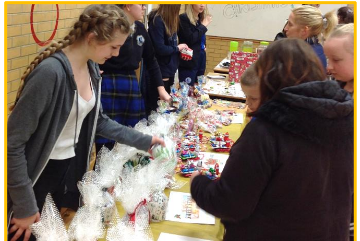
Above: Year 10 scholars help to sell Christmas gifts to parents and staff at the Christmas Fayre. Thanks to their efforts, and the generosity of visitors, over £1,000 was raised.