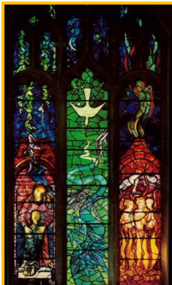
Right: The Britten Window in Aldeburgh Church, which students witnessed being dedicated.