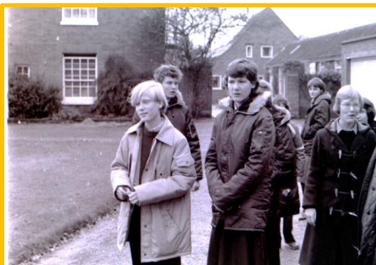
Above: Britten students visit The Red House, Aldeburgh in 1980.